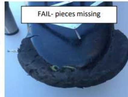
FAIL- pieces missing