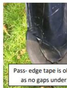
Pass- edge tape is ok as no gaps underneath