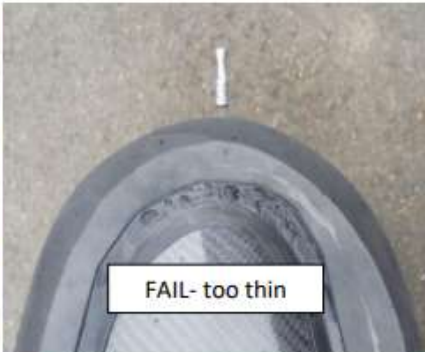
FAIL- too thin