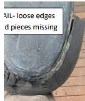
FAIL- loose edges and pieces missing