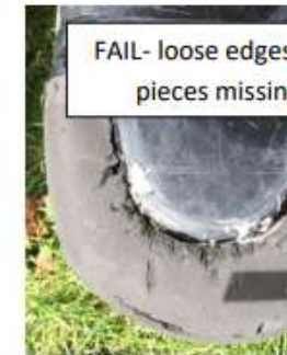
FAIL- loose edges and pieces missing