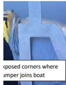
FAIL- exposed corners where bumper joins boat