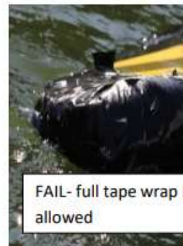
FAIL- full tape wrap not allowed